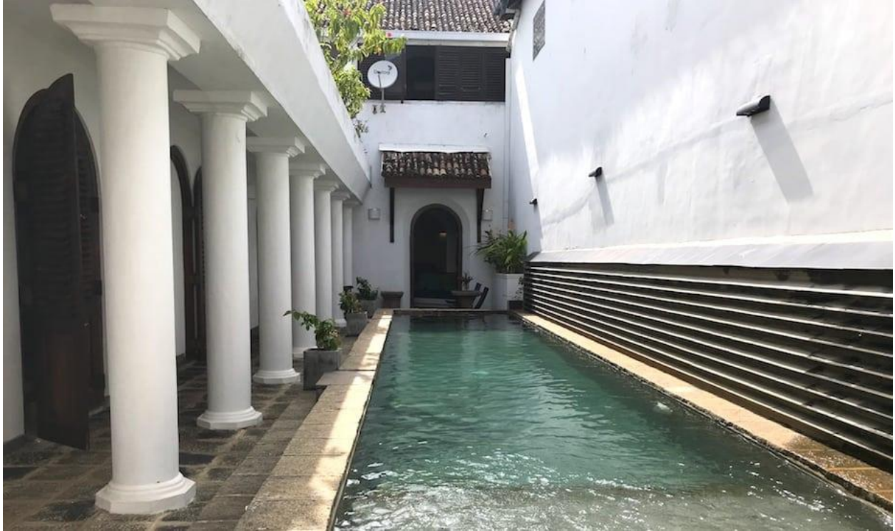
Hit the plunge pool after exploring the old town in Galle Fort.