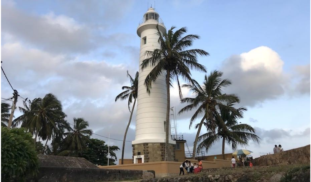
So this is literally down the road from your villa.

And if you've been itching to go shopping since you landed in Sri Lanka, this is your moment. From beautiful textiles at Barefoot, to unique homewares, jewellery and enormous raw gemstones, this town is made for walking... and shopping.