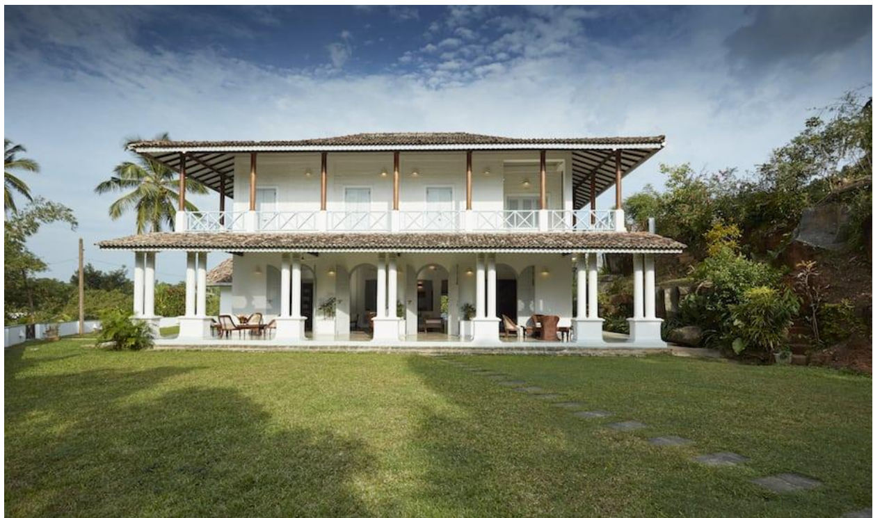
Pooja Kanda Villa is the colonial mansion fantasy stay.