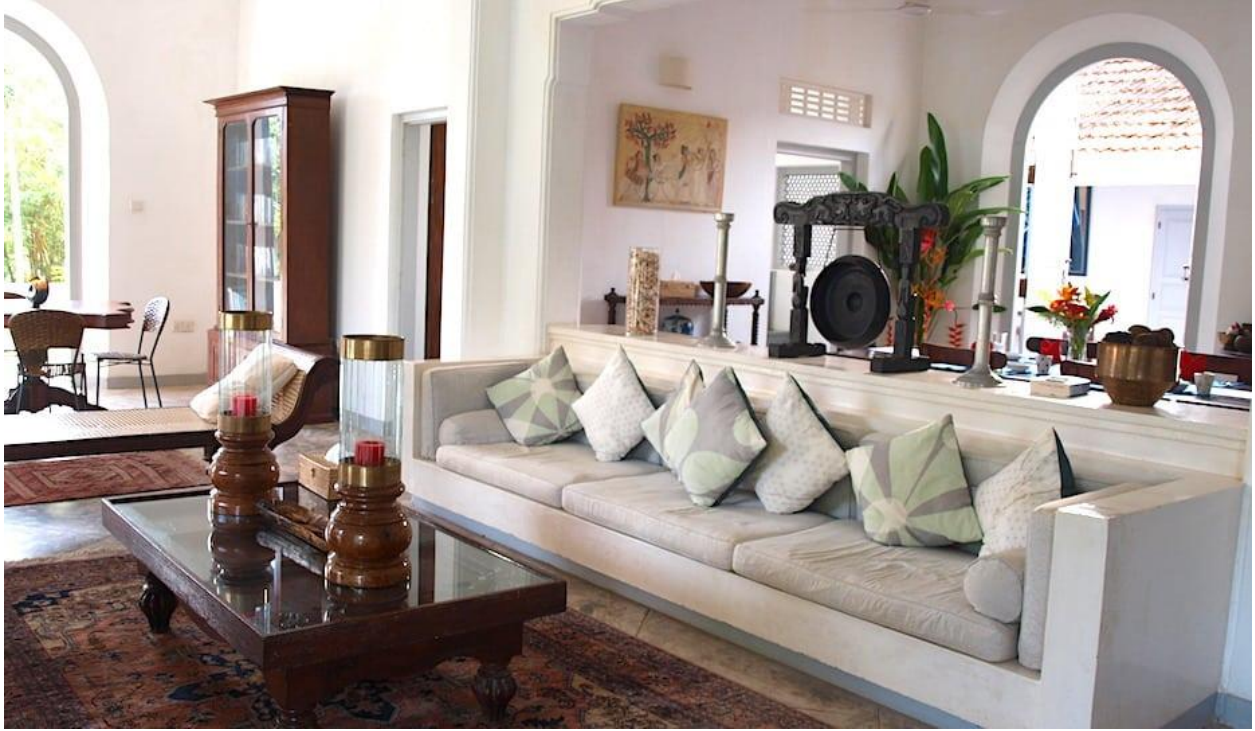
Pooja Kanda Villa was made for spreading out.

It's a five-bedroom villa (three up, two down), built around a 100-year-old property with a helluva lot of character, from the collected seashells and books, to the daybeds aplenty. It feels like a place built for lounging, dining, and more lounging. The front porch is made for sitting back and sipping tea and reading books all day, balconies for taking in that view.