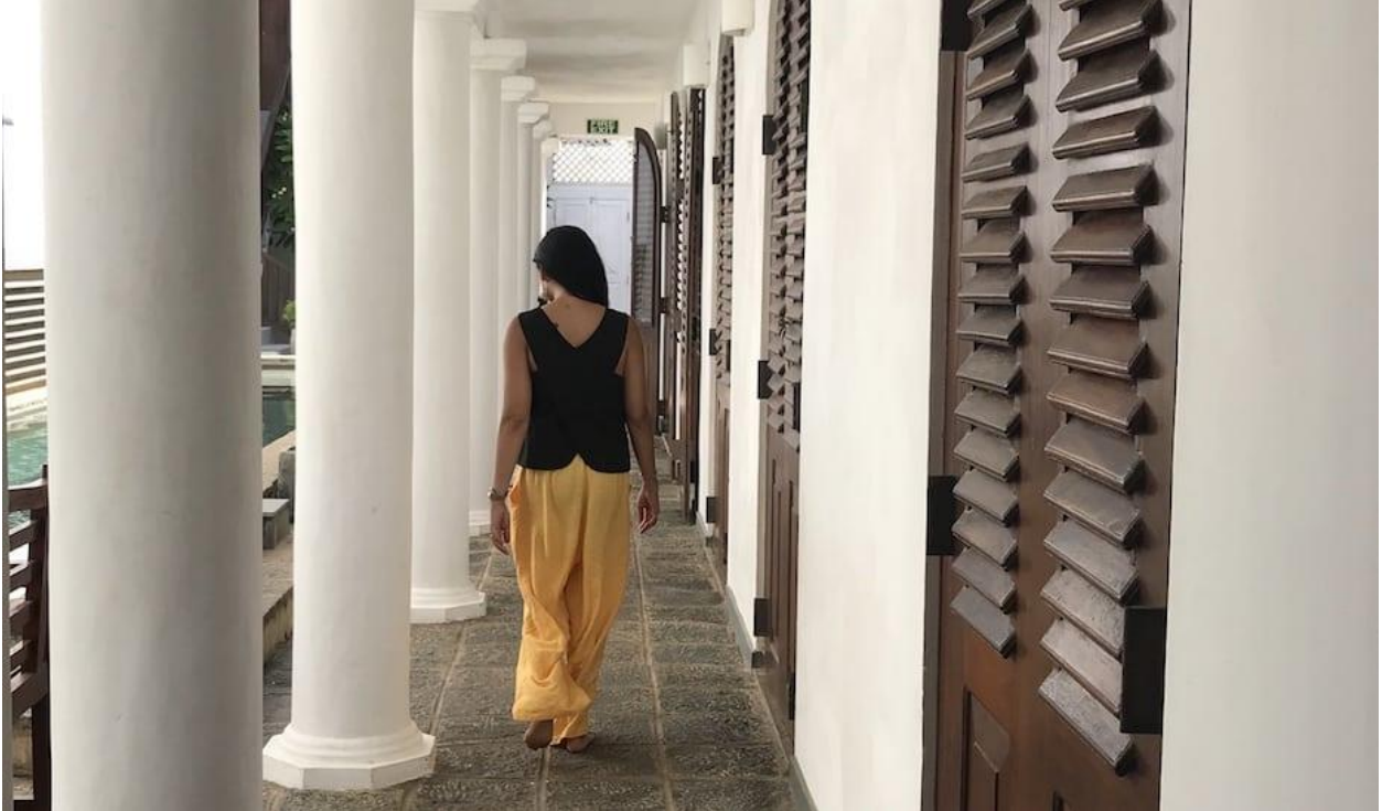
Every corner of this grand old villa is divine.

This is another five-bedroom stay (two up, three down), with a lounge area populated by the most enormous sofa I've encountered, a dining room that fits a crowd and a great little plunge pool for cooling off after exploring the fort. The decor – massive mirrors, tiny antique boxes – is evocative and authentic. There's an upstairs alfresco area you need to spend some serious time in – all whitewashed walls and sky blue cushions, this space was made for sipping Campari-sodas at sunset.