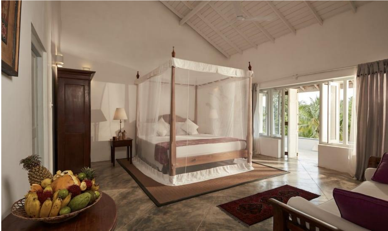
The master bedroom is in the original 100-year-old property, which has been extended to create this spectacular villa.

More indulgences: massages on the back porch and mani-pedis can be arranged by the staff. Yes, you should do it. There's an infinity pool that spills down the hillside; deck chairs for more lounging beside a wall of greenery. Bringing kids? There's a serious stash of toys and the grounds are great for games, rollicking, and gazing at papaya trees. And here's one magic moment: we witnessed the resident pea hen's eggs hatch one morning. Told you this place was special.