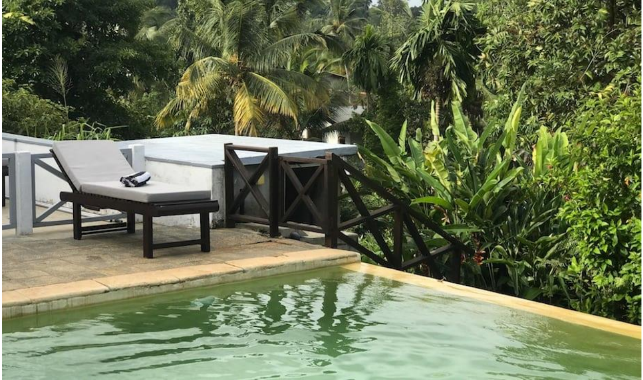
Take a dip: Pooja Kanda Villa feels gloriously secluded.

Yes it's close to Galle Fort (20-30 minutes away), but we're saving that for later. Short ride to the epic Wijaya beach. This is the one you've probably heard your friends rave about. Swing on a rope over the water, take a dip in the rock pools or chill in the seaside restaurant sipping on coconuts (but word t the wise: visit at low tide). You can also go cycling in the hinterland, scuba diving and whale watching (November to April is the season for the latter).