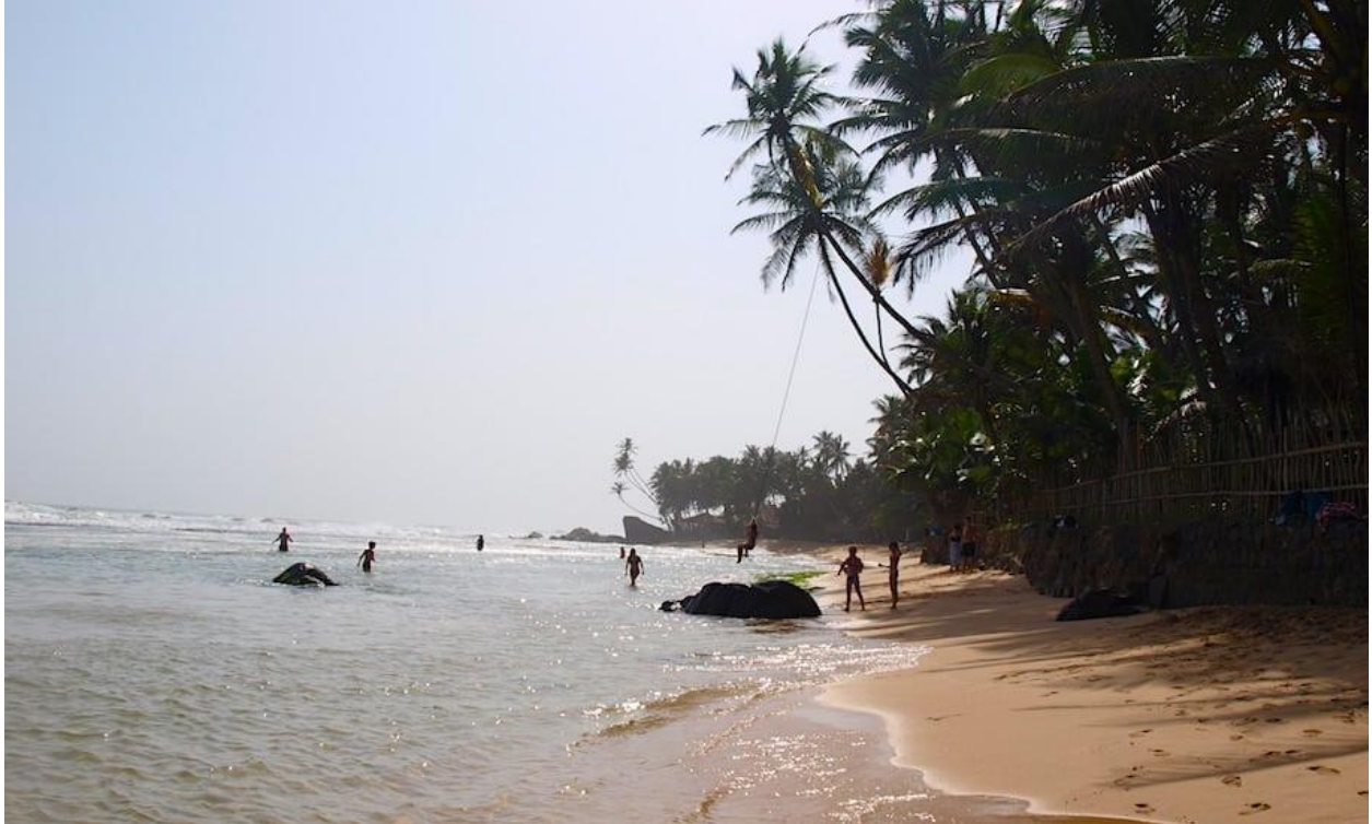
One of the world's special places is just a short drive away: Wijaya beach.

But really, it's tempting to stay in your sprawling mansion all day, every day.