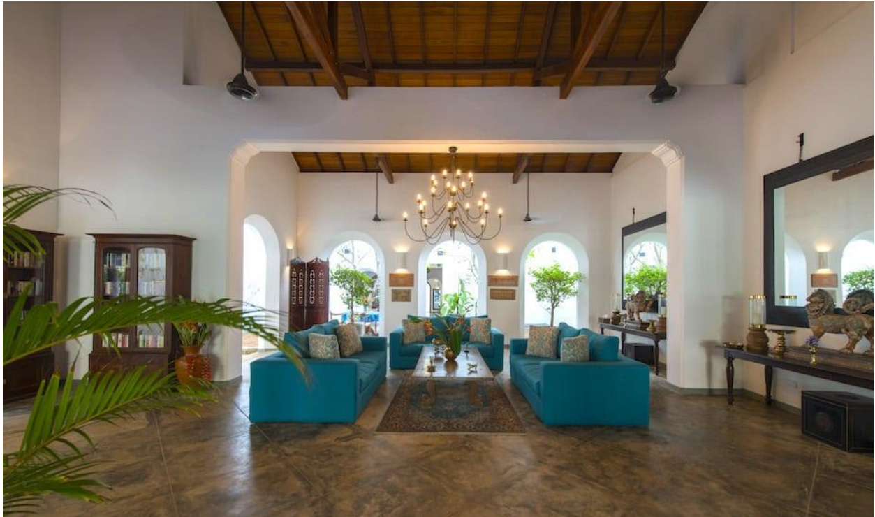
The next-level living room at Ambassador's House, right in the heart of Galle Fort.

When you want to stay in a jewel box in the heart of Galle Fort