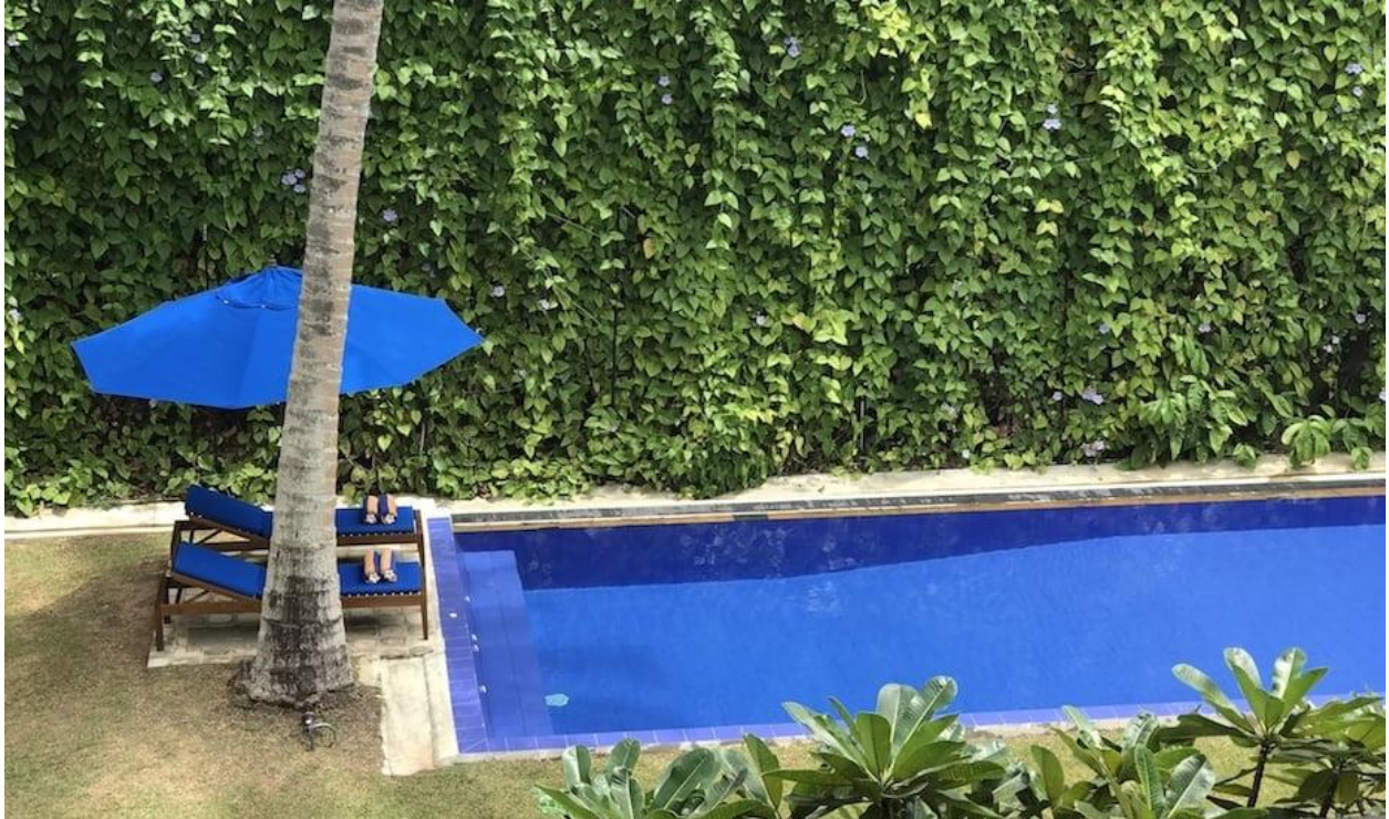
One inviting scene on a sunny day.

This place is all about beach, eat, pool, repeat. As with each of these villas, the in-house chefs can whip up all of your meals; you just need to pay for the supplies, which they'll buy fresh from the market. The local dishes here were spectacular, but truth be told, the kids' menu needs a little work.