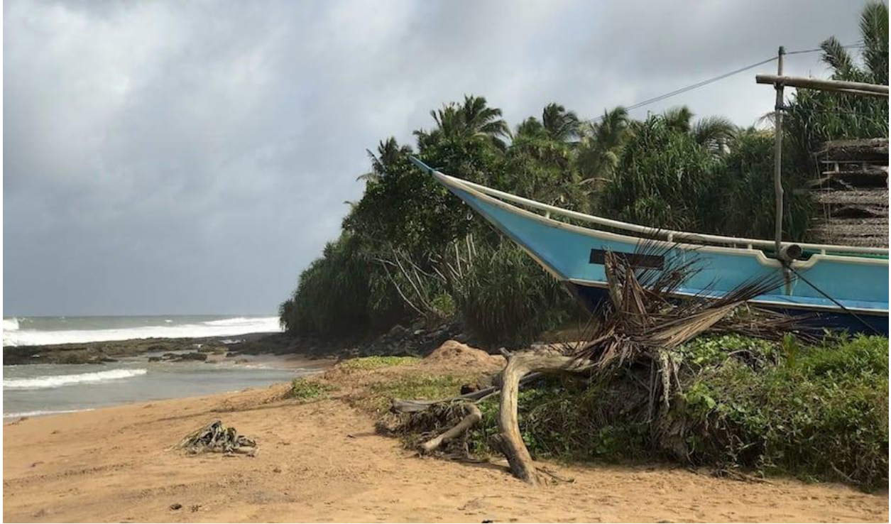
Thambapanni Beach is so close to the villa, you can hear the sea at night.

Saffron and Blue , Sri Gnanawimala Mawatha Hiddaruwa, Kosgoda, Sri Lanka