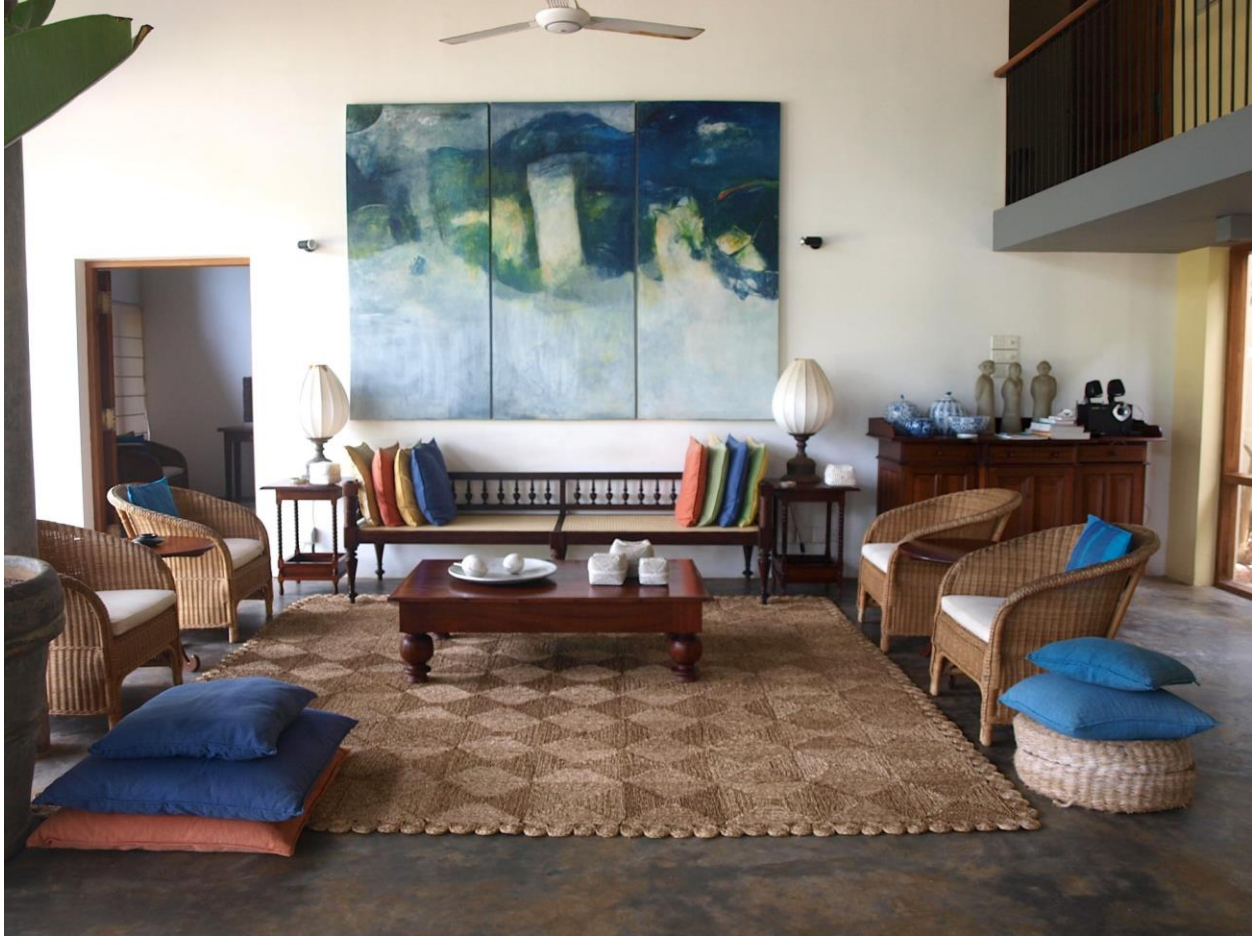
We so want to steal this style.

We need to talk about that pool for a moment. It's stunning, no? But do tear yourself away from that sun lounger, because Saffron & Blue is a moment's walk to Thambapanni Beach. And we do mean a moment: you can hear the ocean at night. Travelling with kids or sandcastle-architects? This is high-quality engineering sand. There's a turtle hatchery on the beach, too.