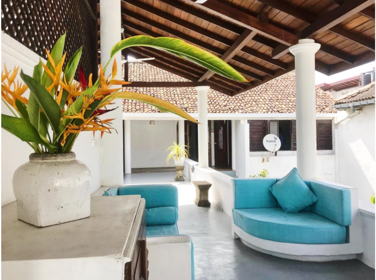
We think we've just found the perfect spot for a sundowner.

What do we love about Galle Fort? The people, for one, are so chill. No pushiness here. It's ridiculously easy to navigate: we tried to get lost, and all roads seem to lead back to Lighthouse Street... and this villa. Hit the lighthouse first – it IS at the end of the street, after all, have a drink with a view at the Old Dutch Hospital, and walk the walls of the Fort. It's amazing.