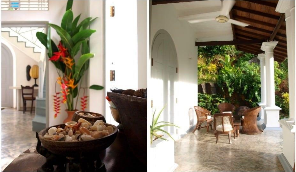
Characterful decor and corners for relaxing.