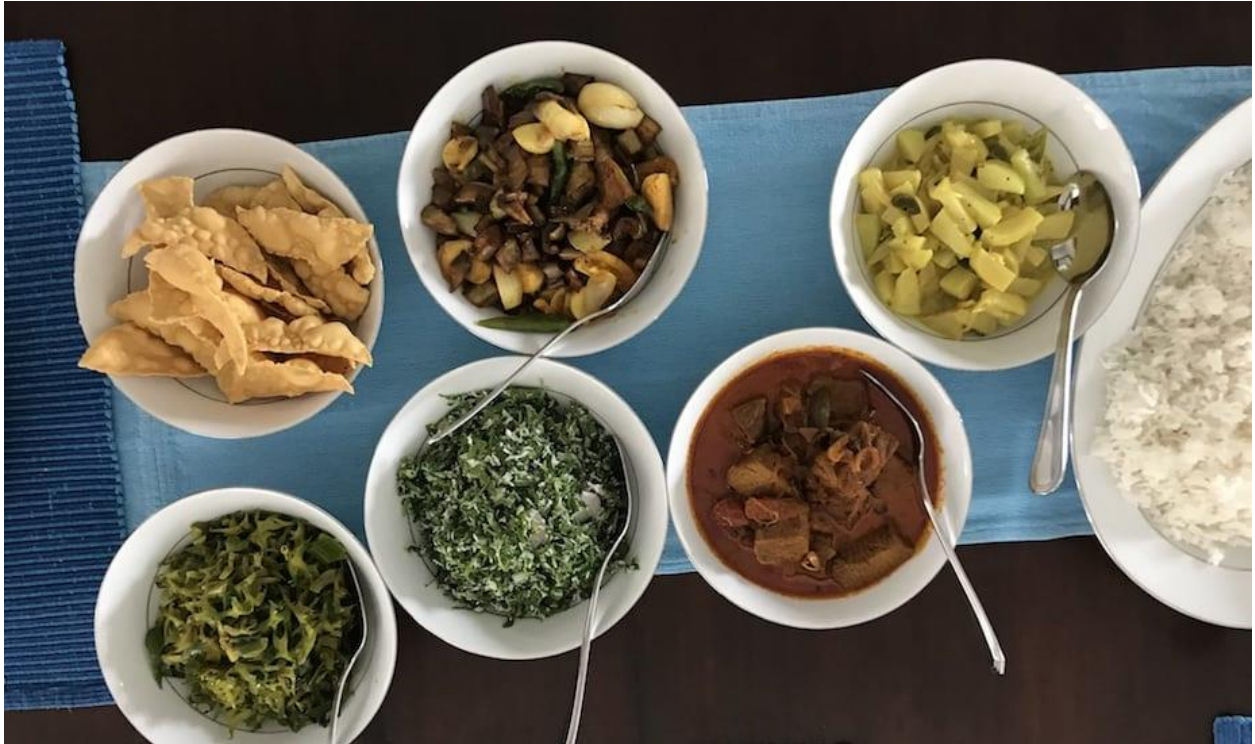
Just your average lunch at Ambassador's House, whipped up by the private chef

Now here's a tricky situation for you: the food being whipped up in your villa is divine, but you've spotted so many gorgeous restaurants a short stroll away. Our strategy? String hoppers for breakfast and all the amazing curries at home for lunch; dinners out. Heads up: there's a trend in town for modern Middle-Eastern menus... but we didn't come all this way for anything other than Sri Lankan. DO head over to Church Street Social for a memorable meal, and to ogle Galle Fort Hotel.