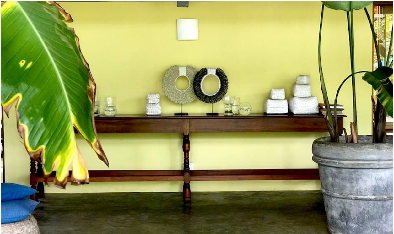
Saffron & Blue villa is one for architect and interior decor lovers.

And finally: the beach stay, and one for architecture and interior decor obsessives. The most modern of the three villas, the aesthetic and atmosphere here provide a cool contrast to Villa Pooja Kanda and Ambassador's House. A striking exercise in modern concrete, this place is all about texture, bold colour and proportion. There are four bedrooms here (one downstairs, three upstairs). The Emerald and the Gold rooms have outdoor jacuzzis. Nice.