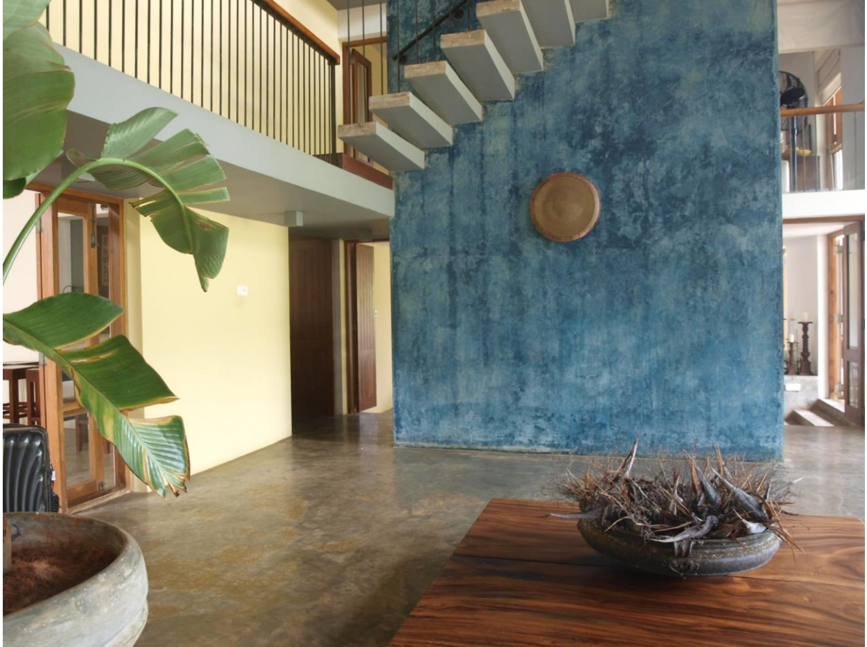
Concrete doesn't get any cooler than this.

There's a sunken dining room with an enormous table that doesn't exactly encourage intimacy, but there's an intriguing mass of candles that brings on the mood at night. And the lounge area? We want to haul the whole scene back to Singapore: the shell necklaces, the wooden mangoes, that enormous jute rug, the massive pots with tropical leaves. You think they'd notice?